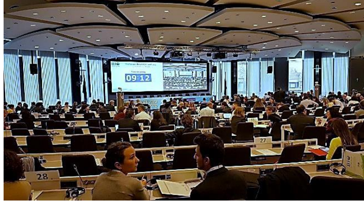
Bilateral meetings at de Gasperi room.