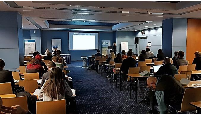
Sustainable Food Security (SFS) flash presentation session.